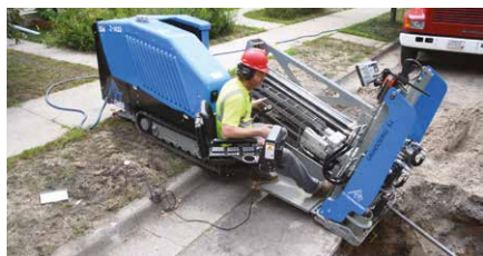
Easy entry angle adjustment from 11-17°