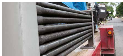
Drill rod capacity 61 metres optionally 76 metres