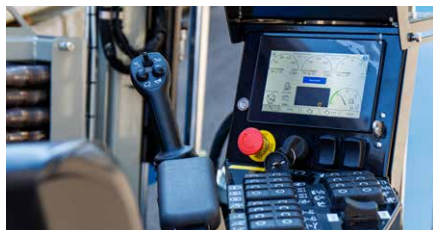
All-Weather 7" touch screen